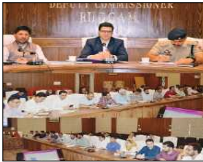
Colleges, Executive Officers of Municipal Development Departments and other concerned officers, from Excise, Police, Health, Education, Rural